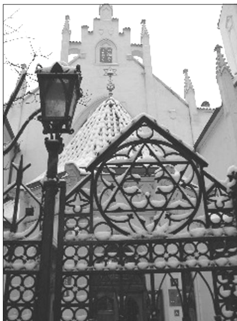
The Pinkas Synagogue, the oldest in Prague. Names of thousands of people murdered by the Nazis are inscribed on its interior walls.