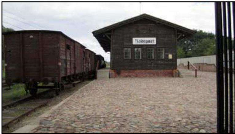
Above: From Radegast station, now part of the Lodz Ghetto Memorial, thousands of Jews were shipped out of the Lodz Ghetto to the death camps. Below: The pits dug by the Lodz Ghetto's last remaining Jews were intended for their own execution.

The several hundred thousand Jews who were incarcerated in the Lodz Ghetto at one time or another were either moved on to death camps or died in the ghetto of starvation, disease or violence. For those who perished within the ghetto, the Germans allowed individual burials, and the Ghetto Field is filled with 45,000 grave sites, crammed in head to toe, elbow to elbow — a closeness that suggests both claustrophobia and comfort. The graves are largely unmarked now. The Nazi rulers of the ghetto allowed no matzevot and the minimal small metal or concrete markers allowed by the Germans have mostly sunk below the ground.