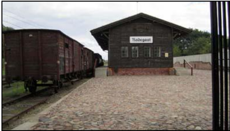
Above: From Radegast station, now part of the Lodz Ghetto Memorial, thousands of Jews were shipped out of the Lodz Ghetto to the death camps. Below: The pits dug by the Lodz Ghetto's last remaining Jews were intended for their own execution.

The several hundred thousand Jews who were incarcerated in the Lodz Ghetto at one time or another were either moved on to death camps or died in the ghetto of starvation, disease or violence. For those who perished within the ghetto, the Germans allowed individual burials, and the Ghetto Field is filled with 45,000 grave sites, crammed in head to toe, elbow to elbow — a closeness that suggests both claustrophobia and comfort. The graves are largely unmarked now. The Nazi rulers of the ghetto allowed no matzevot and the minimal small metal or concrete markers allowed by the Germans have mostly sunk below the ground.