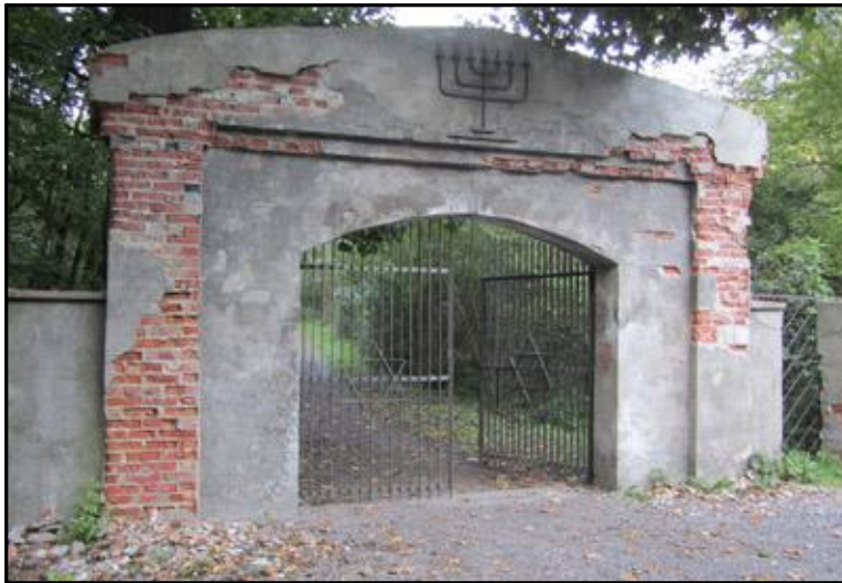
Entrance to the Czestochowa Jewish cemetery

September 2010 was different. Interest in Eastern European Jewish roots has burgeoned, discovery and digitization of records has been prodigious and over the decades my husband and I have learned, first, that difficult and time consuming research is a prerequisite to finding anything of interest; and second, that such research is never finished. So this time we went armed with ample, if not complete, research and modest goals. And this time we were traveling with my cousin, a Polish native who is intensely interested in uncovering his Jewish family past.