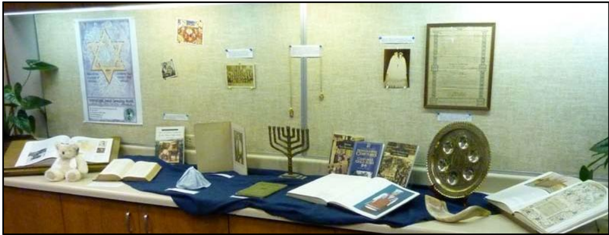
SFBAJGS displayed items related to Jewish genealogy at the Oakland FHC for Jewish Genealogy Month.