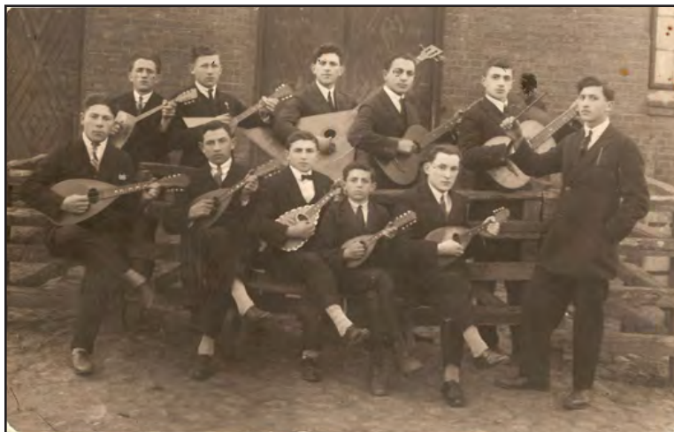
The Ger Mandolin Orchestra in the 1930's