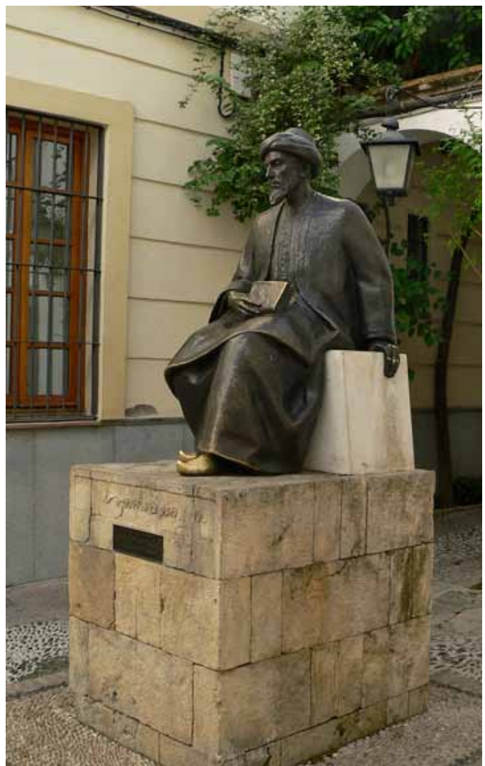
The statue of Maimonides in Córdoba

Emerging into the daylight, we continued our tour of the Jewish quarter of Córdoba, pausing in a tiny plaza at a statue of native son theologian, philosopher, and physician Maimonides. His bronze feet appeared shiny in the sunlight from the many hands who had touched his shoes. Maimonides' real feet helped carry him away when at the age of 15 he fled Córdoba with his family, seeking to escape a newly repressive Moorish rule under