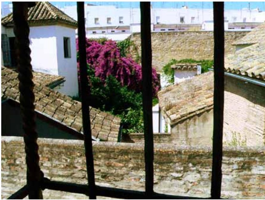
View from the second floor of Casa Sefarad, with the synagogue on the right

the conservative Almohads. Born about 1135 CE, Maimonides, or Moses ben Maimon, also known by the acronym RaMBaM 4 , missed the golden era of the more progressive Umayyad Moorish rule. 5