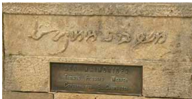
Plaque on the statue of Maimonides in Córdoba

Upcoming SFBAJGS Events ..... back cover