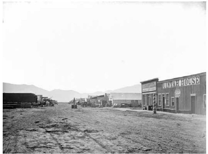
1869 photographs of Corinne by William H. Jackson.

Left: "Street view in Corinne. Box Elder County, Utah" (NARA 517300; https://commons.wikimedia.org/wiki/File:Street_view_in_Corinne,_Box_Elder_County,_Utah,_1869_-_NARA_-_517300.jpg ). Right: "View in Corinne, Box Elder County, Utah" (NARA 516652; https://commons.wikimedia.org/wiki/File:View_in_Corinne,_Box_Elder_County,_Utah_-_NARA_-_516652.jpg ).