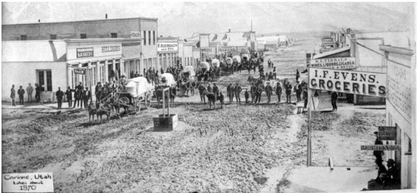
Corinne circa 1870

and arid landscapes to Pocatello, Idaho, rafting down the Green River through Dinosaur National Monument and its beautiful yet relatively dry river terrain, and exploring the great national parks in southern Utah: the stark red desert beauty of Canyonlands, Arches, and Bryce, and my favorite, Zion, the “lushest” of the four. I also had come across some photos online of Corinne itself as it formed in 1869 that reveal a tumbling of tentlike buildings on flat dirt plains devoid of plants and trees, and images of people whom I imagine likely wanted to dive into the Salt Lake or the Bear River to remove the dust that inevitably would have coated their skin and clothing. All of my Utah experiences have conveyed the drier, desertlike qualities of the land, the value of each drop of water.